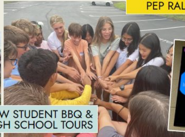
NEW STUDENT BBQ & HIGH SCHOOL TOURS