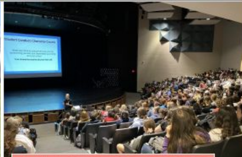
COMMUNITY & CULTURE SCHOOLWIDE KICKOFF