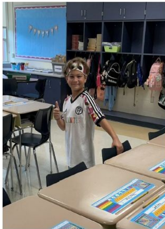
Best Bryce Harper impression!