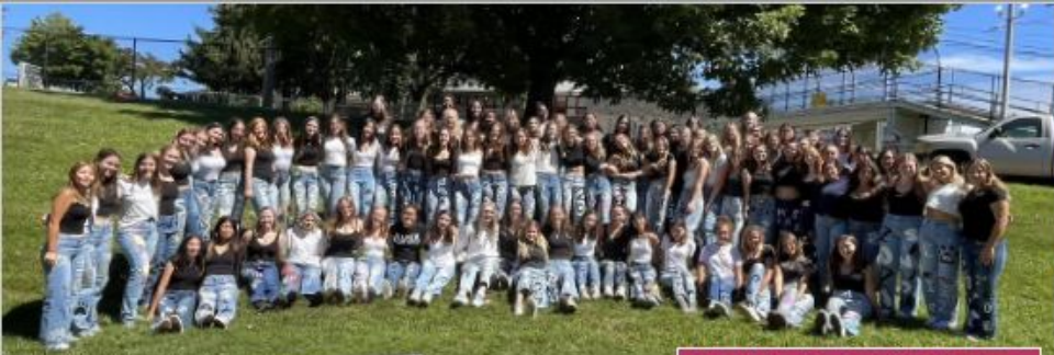
SENIOR SUNRISE & SENIOR "JEANS"