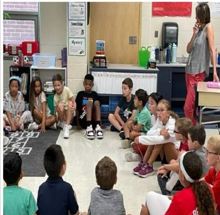
Grade 4: It all starts with a Greeting Circle