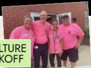
COMMUNITY & CULTURE SCHOOLWIDE KICKOFF