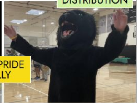
PANTHER PRIDE PEP RALLY